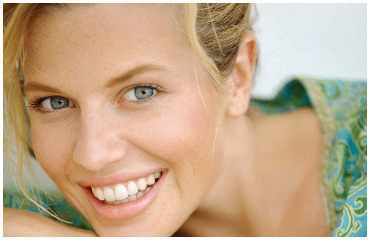
Janome is a proud sponsor of the National Breast Cancer Foundation, Inc.®